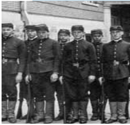
Above— Early 19th Century Cadets. Norwich, CT.

The United States Army Junior Reserve Officers' Training Corps (JROTC) came into being with the passage of the National Defense Act of 1916. Under the provisions of the Act, high schools were authorized loans of federal military equipment and the assignment of active