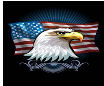
November 11, 2009 Veteran's Day

cluded on the 11th hour of the 11th day of November in the year 1918. On November 11th of the following year, President