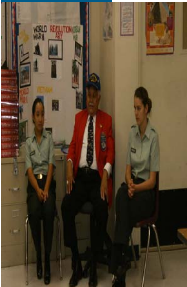
(Below) LTC Noel Gray Tuskegee Airman