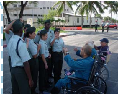
Above— WWII veterans at the Miami V.A. Hospital. Right— 2009 Pass and Review ceremony.